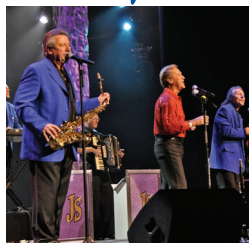
JIMMY STURR & His Orchestra